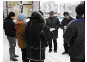
(This message is going around the world. Moscow above.)

“Christians do not keep the law to obtain salvation—Those who try to do so will only find a deeper en-