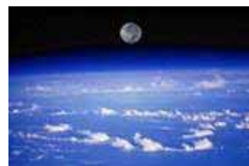
NIGHT AND DAY

Calvinists believe that we are saved entirely apart from any good or evil things we might do in this life.